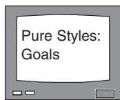
EVERYTHING DiSC® DVD