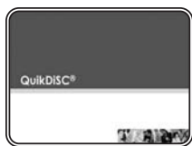
PPT 5-2 QuikDiSC®